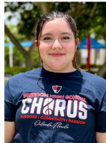
Ully Tristao Patriot Singers Rep