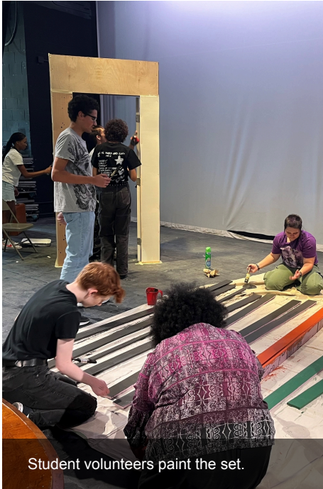
Student volunteers paint the set.