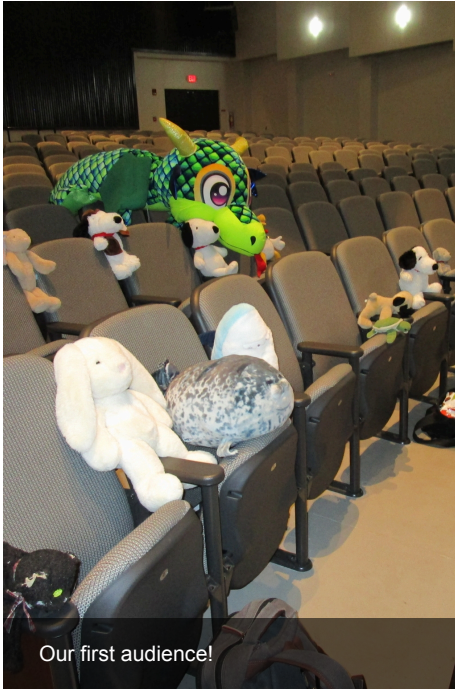
Our first audience!