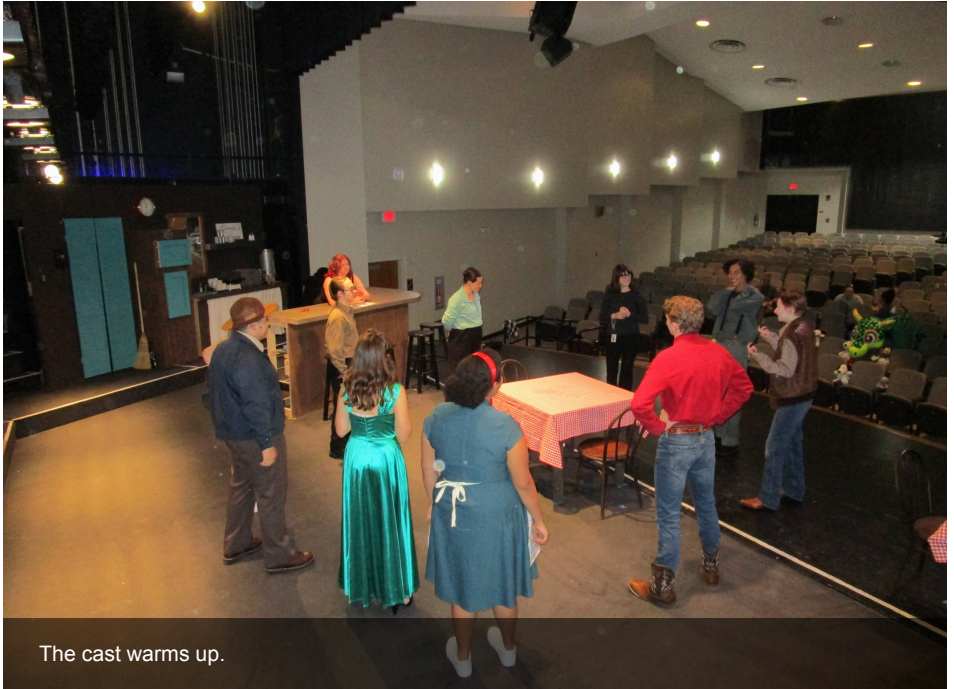
The cast warms up.