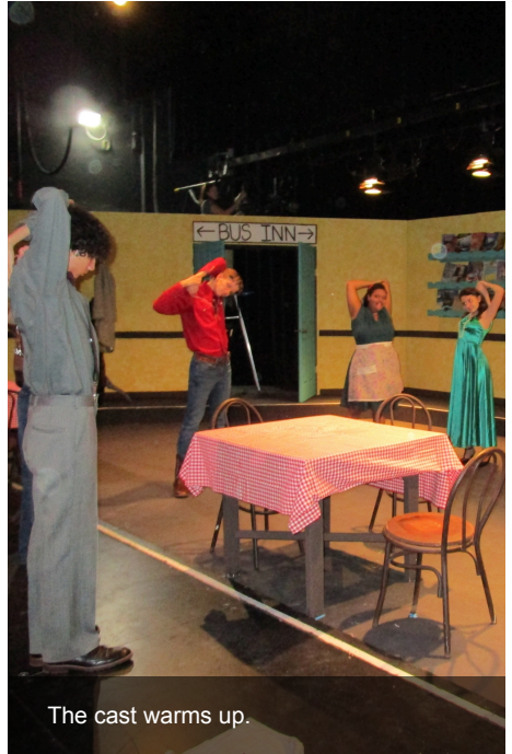
The cast warms up.