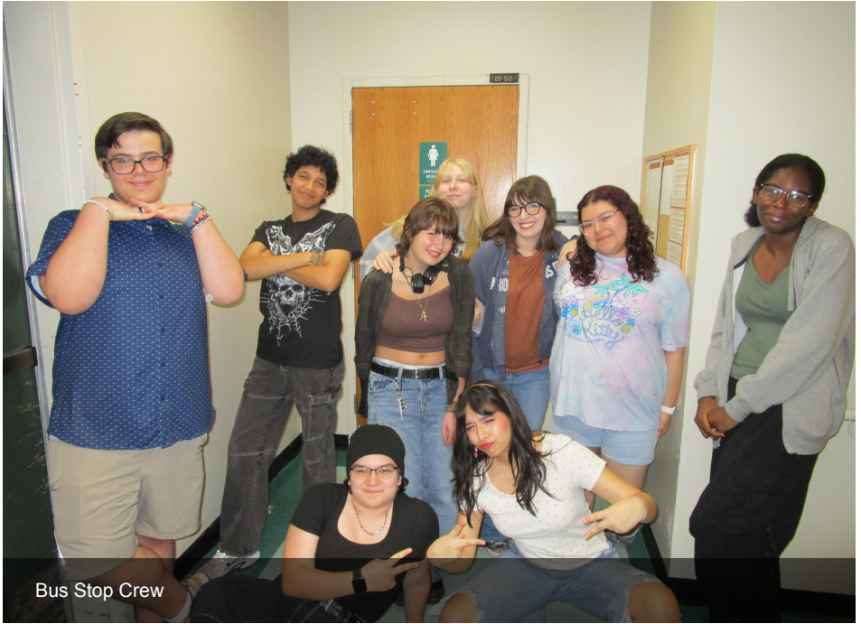
Bus Stop Crew