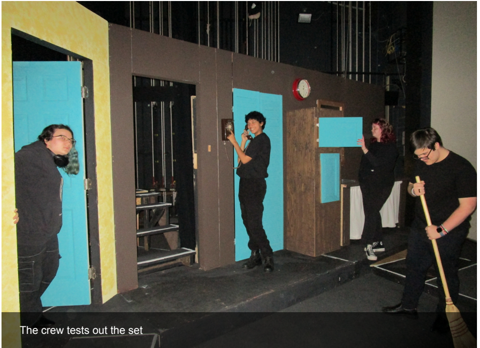
The crew tests out the set