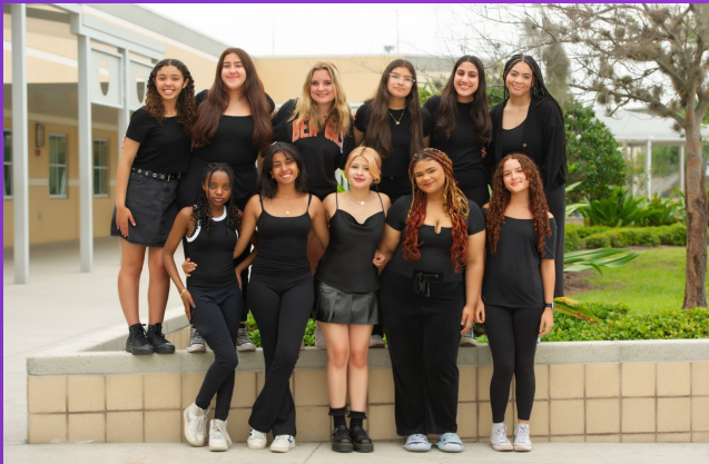
Hair & Make-up