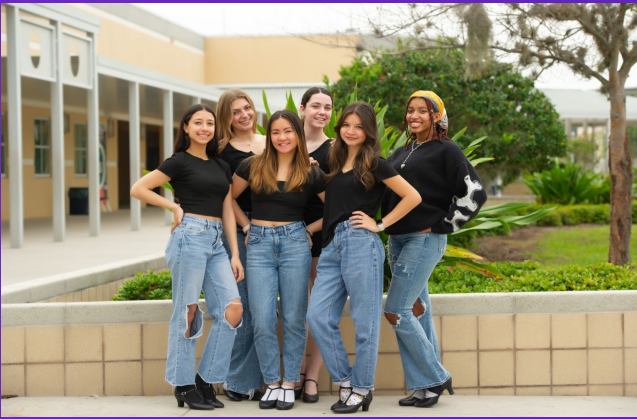
Can-Can Girls Ensemble